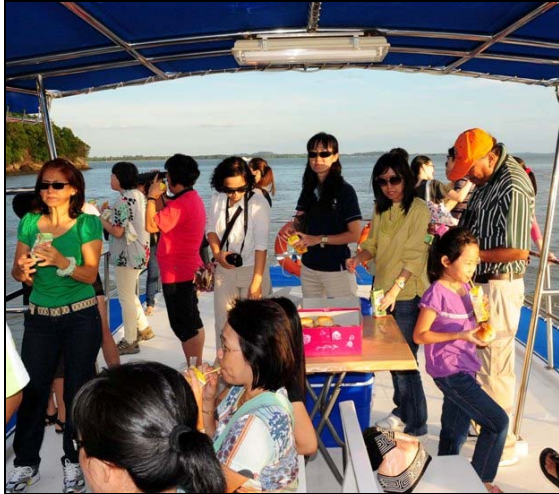
Having refreshment on board.

The sun was slowly setting and it was a good time for sunset photography. It was also at this time that our cruise encountered some engine problems because of plastic bags and rubbish that were entangled onto the propeller. Hence, we were stuck for quite a while. The ship moved in tandem with the waves and one could not even walk properly. The rocking motion was a bit too much for a few of us, and we had to hunt for sea sickness bag to throw up. While busy throwing up, I missed the opportunity for the best sunset shot for that evening!