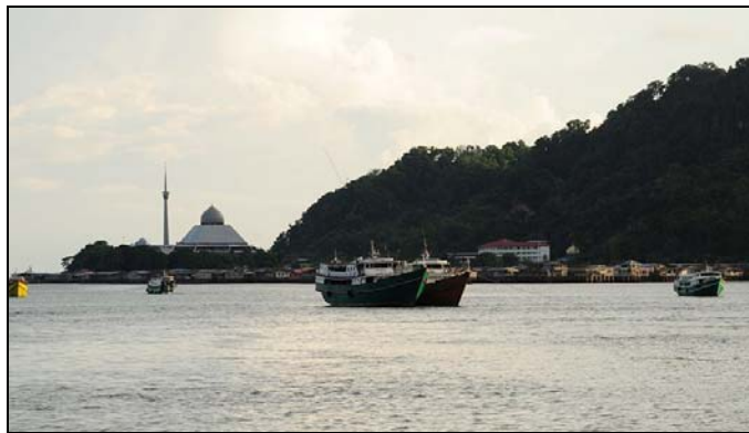
View of the Sandakan Mosque and Kg. Buli Sim Sim from the cruise.