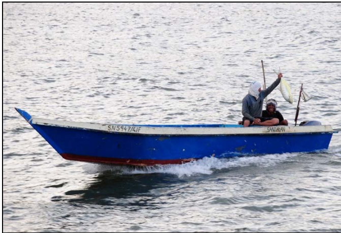
The fisherman showing off his catch of the day.

fondly known till today. Prior to the war, Berhala Island had a small leper settlement colony. However, not much is known about the exact location of this settlement on the island.