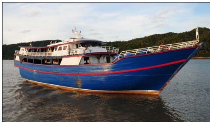
Close-up of a Filipino boat that brings bartered goods.

Moving on, we passed through some giant boats, and we were told that they were licensed Filipino boats from the neighbouring country under the barter trade system. These boats were quite unique in appearance and we managed to snap a few close-up shots.