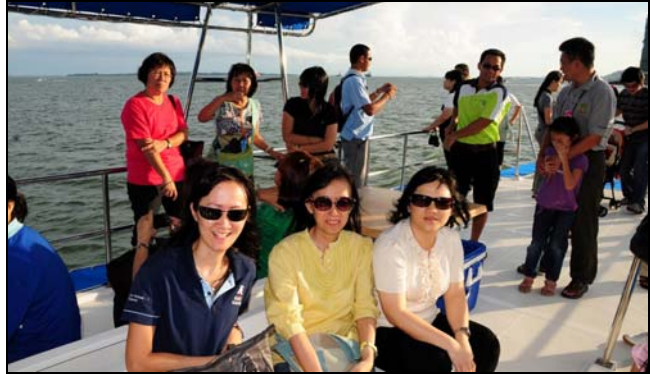
Some of the participants of the cruise.